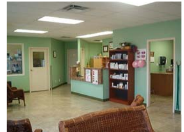
A quick glance at our reception area. Please drop by and have a look around, if you haven't already!

Surgery is bright and sunny with enough room for a sec-