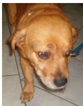
The Romy Fund was able to provide Basil with an exploratory to discover the extent of his injuries.

The Romy Fund continues to help animals through the generous donations of people like yourselves.