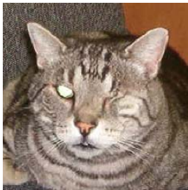
One Eyed Jack is rather a shy clinic cat.